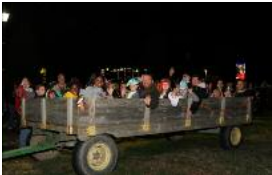
Residents enjoying the hayride at the Gloucester Township Trunk or Treat held at Veterans' Park on October 28, 2014.