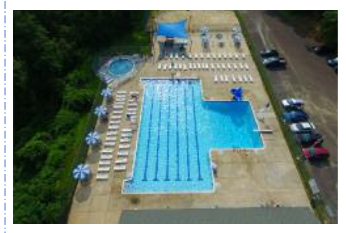
The Gloucester Township Municipal Pool was completely renovated last year. Check out membership and swim lesson info on page 13.