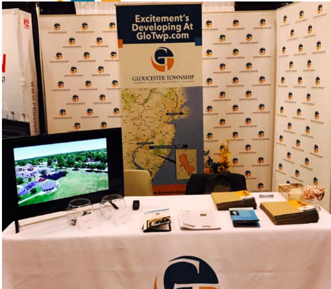
Gloucester Township booth at 2017 ICSC Conference in Atlantic City.