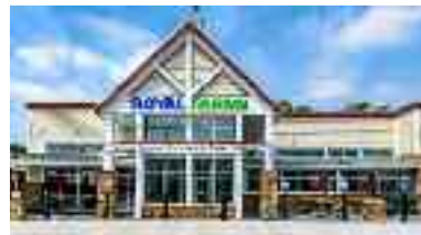
Royal Farms A Maryland-based convenience store chain with gasoline dispensing.