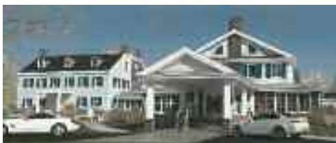
Founders Grove A wedding and catering facility that will be located on Evesham Road.