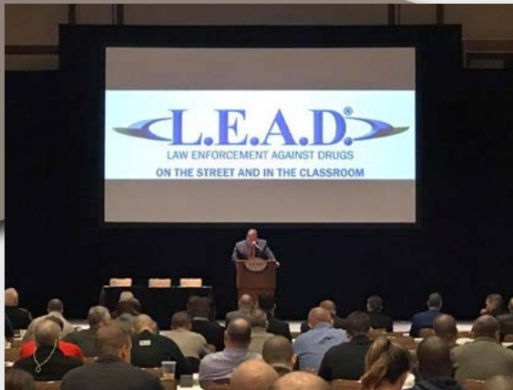
Workshops featured National Leaders and International Experts