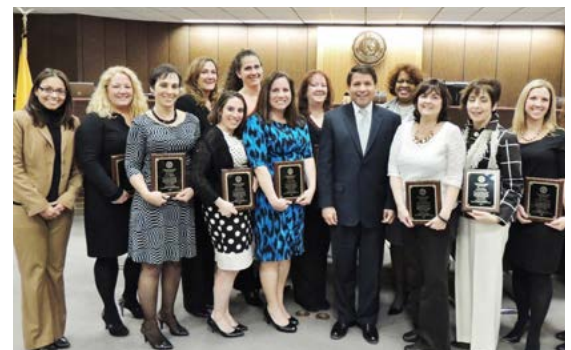
2015 Women Who Make a Difference honorees.