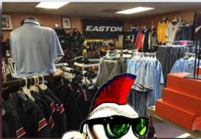
SPORTS OUTLET, INC

They offer sports enthusiasts the latest in uniforms, equipment, and accessories in Baseball, Softball, Football, Basketball, Hockey, Soccer, Wrestling, Field Hockey, Volleyball, and Umpire/Referee. Sports Outlet appreciates your business and they are happy to serve the community of Gloucester Township!