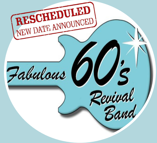
Fabulous 60s August 19