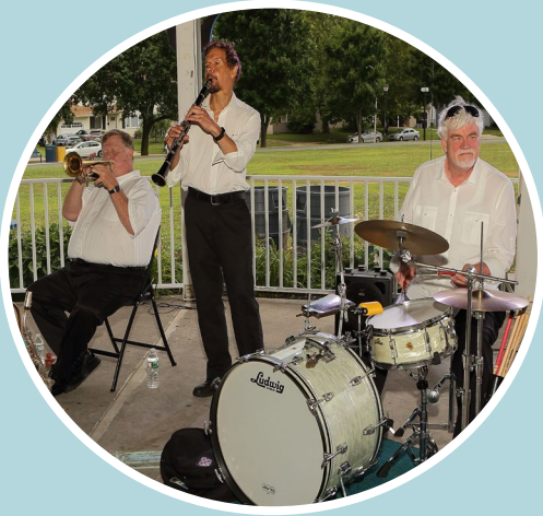
The Old Jazz Daddies July 29