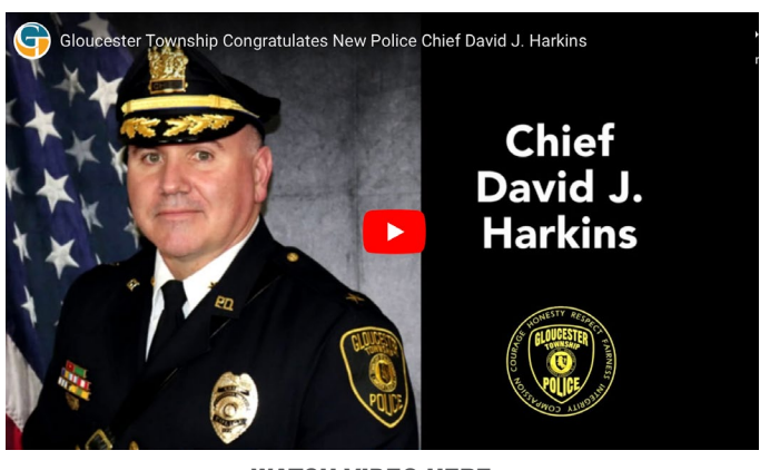
WATCH VIDEO HERE