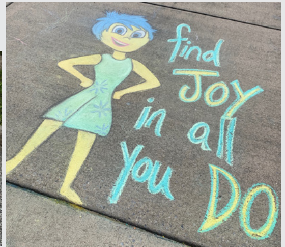
Art by residents in the Sicklerville section