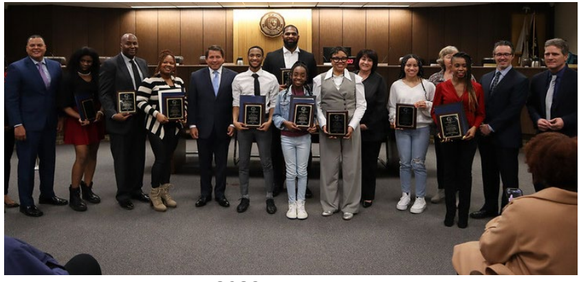
2023 Black History Month honorees

Nominations must include an essay supporting the nominee's accomplishments. The awards will be presented on February 26, 2024 during the Gloucester Township Council Meeting at the Gloucester Township Municipal Building. Nominations must be received by Monday, February 8, 2024 at 5:00 PM.