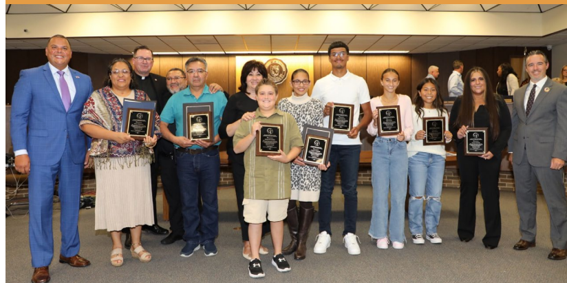
2023 Hispanic Heritage Month Honorees

Nominations are still being accepted for the Gloucester Township Hispanic Heritage Month Celebration for the exemplary citizens who have demonstrated significant contributions in the area of community service, personal or professional achievements, or general good deeds that have impacted favorably on our citizens.