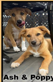
Ash & Poppy